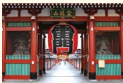
⑧ Tokyo (Senso-ji)