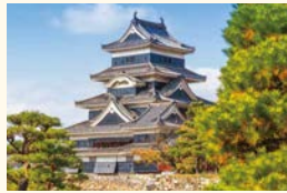
① Matsumoto Castle

If you want to make the most of your trip in Eastern Japan, we recommend a visit to the Nagano and Niigata areas. Both are relatively close to Tokyo and offer a wide variety of sightseeing spots, including leisure facilities such as hot springs and ski resorts – all surrounded by stunning views.